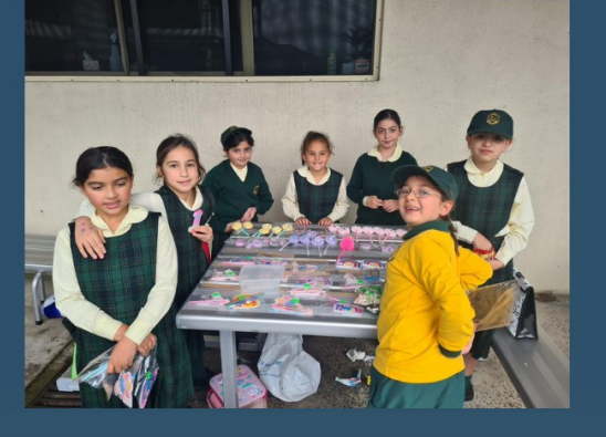
"Anyone need any pens, pencils, rubbers, notebooks, stickers, etc?"