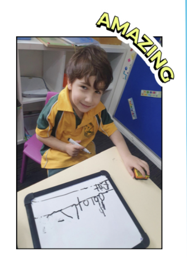
perfecting our handwriting features