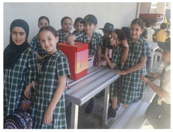
"HOW LUCKY CAN ONE BE? STICK YOUR HAND IN A BOX AND GET AN AMAZING PRIZE! ALSO, BEAUTIFULLY COLOURED STATIONERY AND JEWELLERY AVAILABLE TO BRIGHTEN ANYONE'S DAY!"