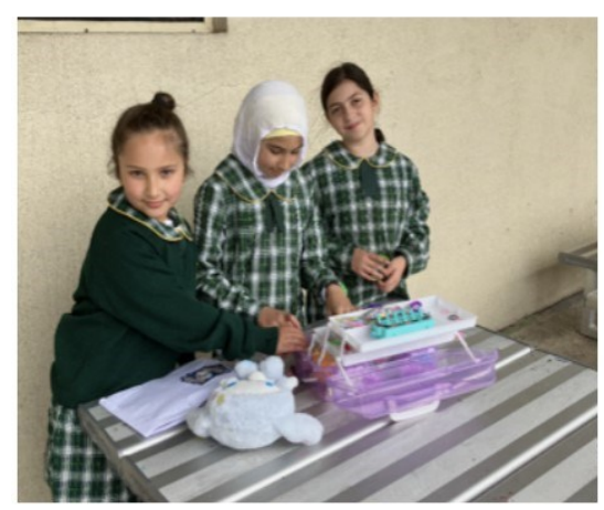
"LOOMBANDS AND COLLECTOR CARDS MAKE THE WORLD A BETTER PLACE TO LIVE IN. HOW COULD THEY NOT?"